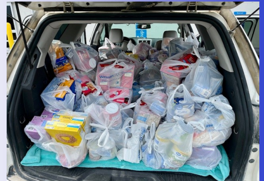
1st/Five car loaded at Walmart!