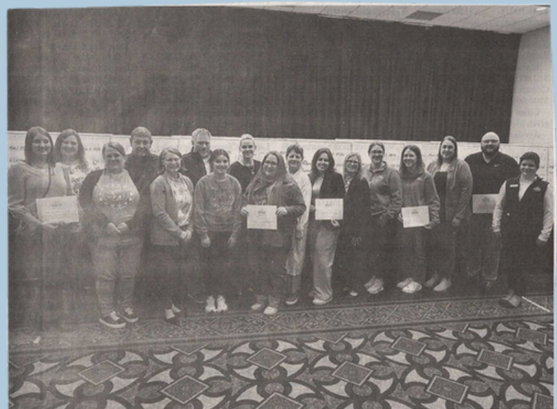
Upper Des Moines Opportunity, Inc. $10,975.00 for UDMO Outreach Entrance Project-Facility Safety and Accessibility Upgrade, Upper Des Moines Opportunity, Inc. $3,736.00 for UDMO Headstart in Emmetsburg:

Thanks to Spirit Lake High Noon Kiwanis and the Spirit Lake Key Club for their generous donation of money and peanut butter and jelly for their annual PB&J drive in support of Dickinson County UDMO!