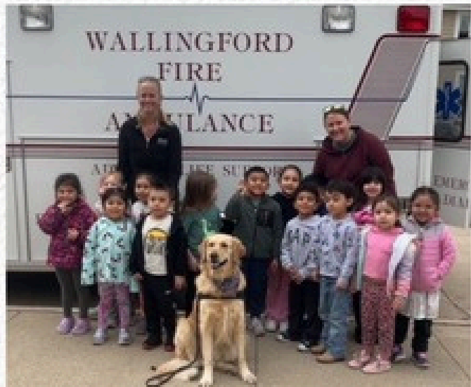
Emmet county head start 3 ambulance visit